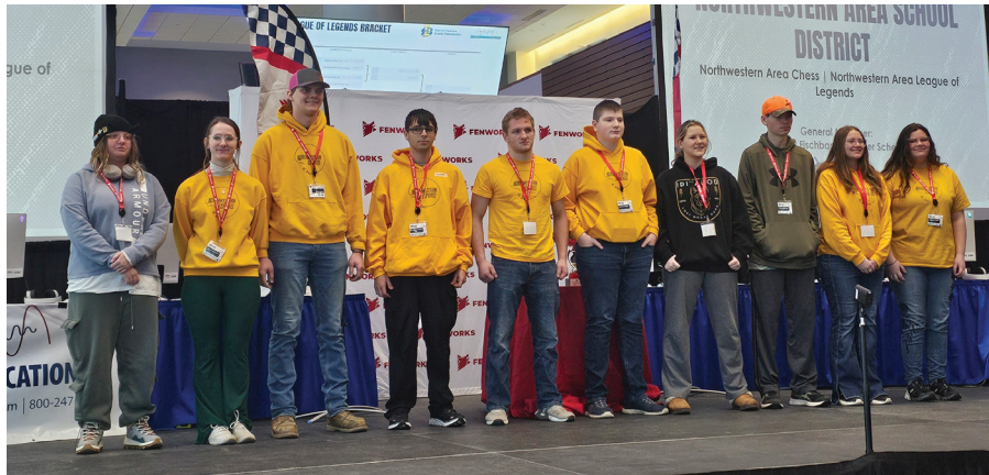
Pictured from top to bottom are the esports teams from Warner Area, Northwestern Area, and Aberdeen Central High Schools on stage at the state tournament. Congratulations on your season!