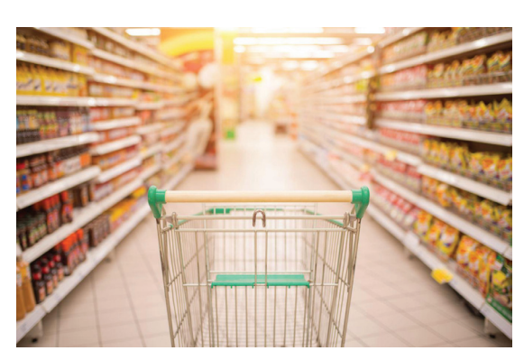
randomly select one of our "grand" residential customers to win. Maybe our next winner will be you!

Wondering how to register? No problem, because there's no purchase or registration, just winners! Each month we will